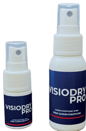
Volume : 25mL Surface : 1,3m 2